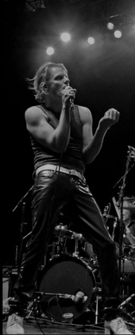
GLENN DI BENEDETTO - SINGER, SONGWRITER